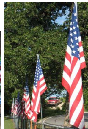
Decoration Day photos courtesy of Sherry Whigham, Town of Westlake